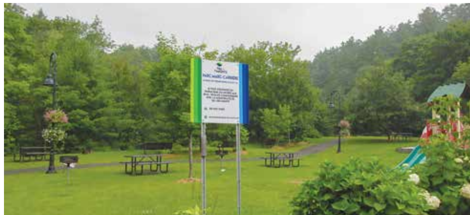
Val-des-Monts is one of eleven Outaouais municipalities taking part in the Fleurons du Québec program, a provincial initiative that rates communities on the quality of their green spaces and rewards those that make sustainable beautification a priority.

The Outaouais municipalities enrolled in the program are Blue Sea, Bouchette, Duhamel, L'Ange-Gardien, Maniwaki, Messines, Montebello, Ripon, Sainte-Thérèse-de-la-Gatineau, Val-des-Bois, and Val-des-Monts. Val-des-Monts, which earned