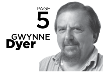
PAGE 5 GWYNNE Dyer

HULL • CHELSEA • AYLMEYER • BUCKINGHAM • LUSKVILLE • WAKEFIELD • PONTIAC