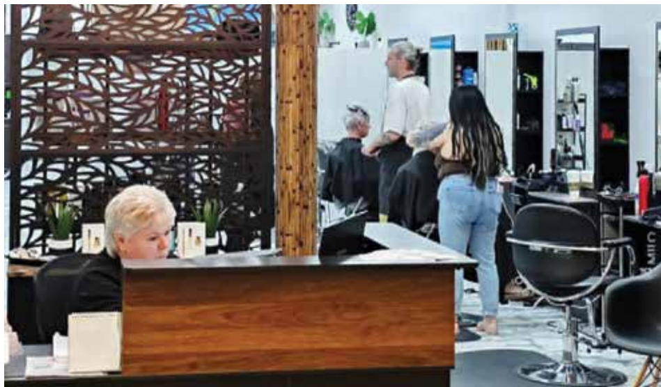
Women in Quebec are still earning less than their partners and absorbing more of the unpaid burden at home, and a new provincial report shows the problem is worst for older women and those in low-income households. (TF)

Even among couples where both partners work, women across Quebec still earn