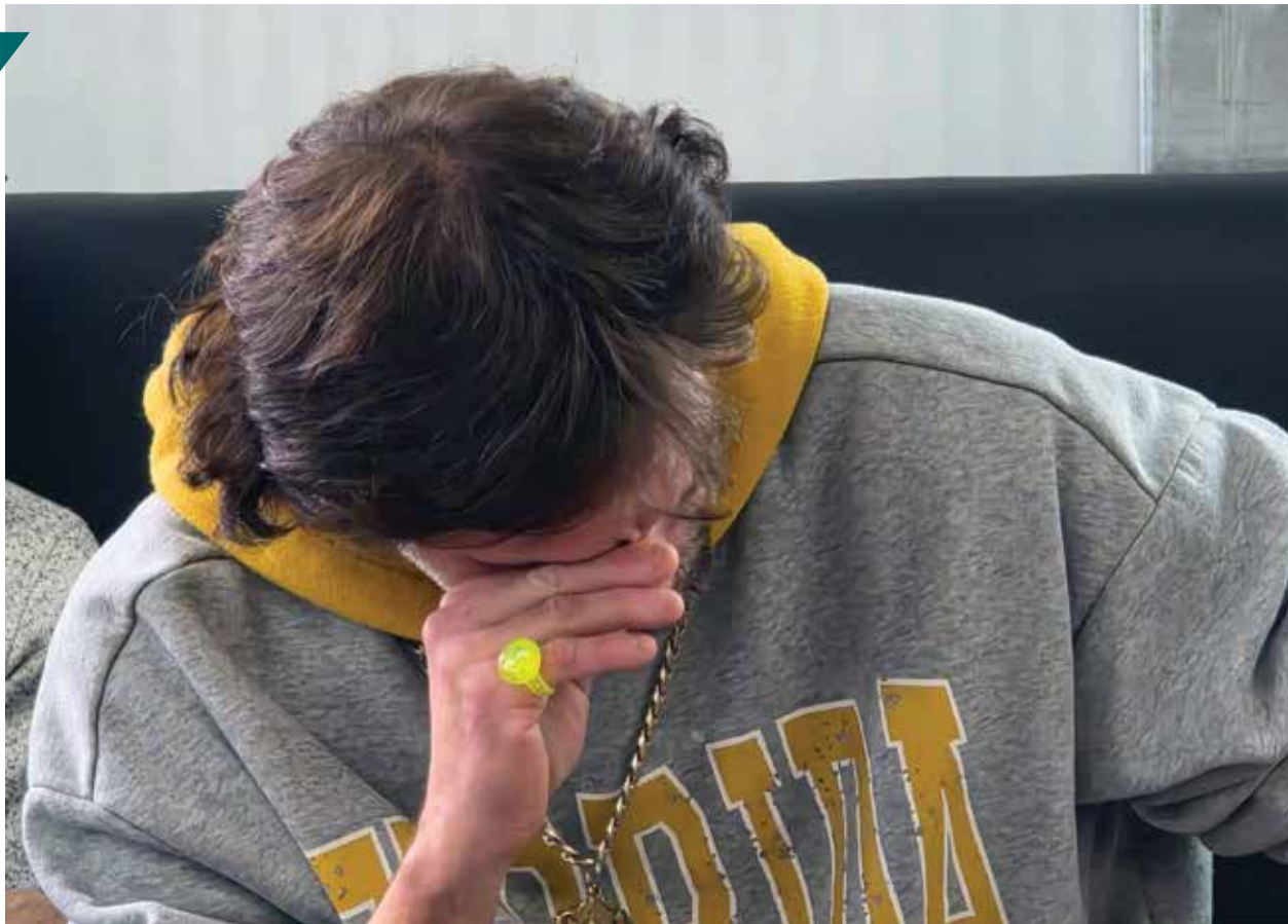
A new IRIS report finds that a single person in Gatineau needs to earn more than $43,000 after tax to escape poverty, the highest threshold of any city in Quebec, as rents surge and the minimum wage falls further behind the cost of living. (TF)